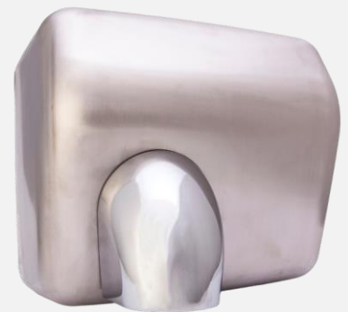
WAHD-1003 2,3KW HAND DRYER