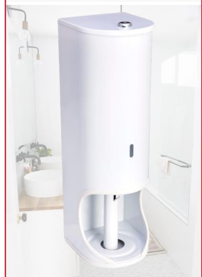
WATR-1004 TOILET ROLL HOLDER