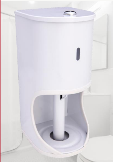
WATR-1002 TOILET ROLL HOLDER

PRICES ARE EXCLUSIVE OF VAT.E &OE. VALID FOR MATUS ACCOUNT HOLDERS ONLY.