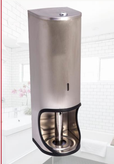
WATR-1003 TOILET ROLL HOLDER